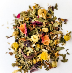
WELLNESS DIGESTION TEA